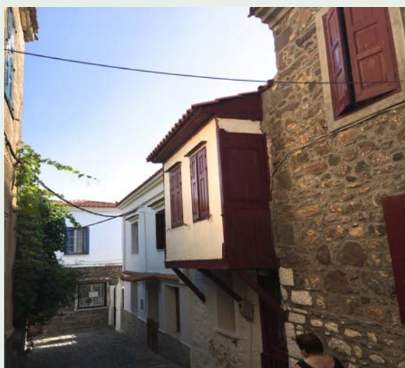
Picturesque homes in Molyvos, Lesvos.